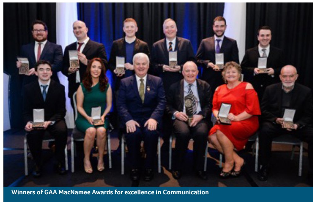
Winners of GAA MacNamee Awards for excellence in Communication

This site is vibrant and aesthetically pleasing to the eye, the ease with which the user can navigate and locate information is testament to the developer and it shines a positive light of GAA activity within the county both through its content and its lay-out.