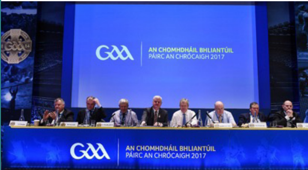
Above: The top table at GAA Congress