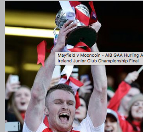
Mayfield v Mooncoin - AIB GAA Hurling All-Ireland Junior Club Championship Final