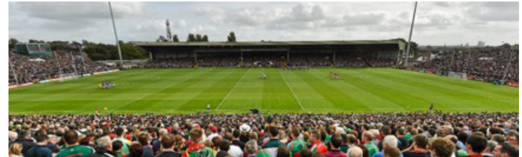
In 2014 there was a capacity crowd in Limerick's Gaelic grounds for the semi-final replay between Kerry and Mayo. The new plan will play more big games at provincial venues

But the definition of any competition or championship is to establish who the best is.