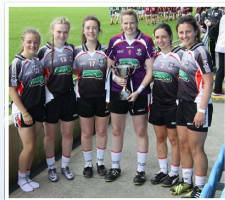
St. Nathys Connacht Champions