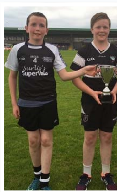
A2 Hurling Shield Winners

All our underage teams are preparing for their upcoming championship campaigns over the coming weeks. During their league campaign, the U-12 Team have played many blitz games and have performed excellently during their campaign. The U-14 Team reached the league semi final where they were defeated by a strong St Patrick's side. Our U-16 Team were knocked out of the league at the quarter final stage, but went on to win the Division 2 League shield with an excellent win over St Marys in Scarden last month, final score 5-11 to 0-12. Our Minor Team lost out narrowly in the Division 2 League final against St Molaise Gaels on a score line of 1.10 to 1.09.