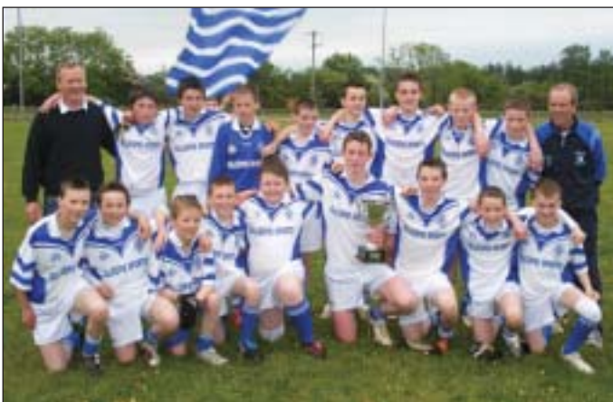
Under 14 Division II Champions 2008 (B Championship Finalists '08)