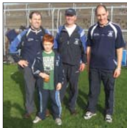
Intermediate Management Team 2008