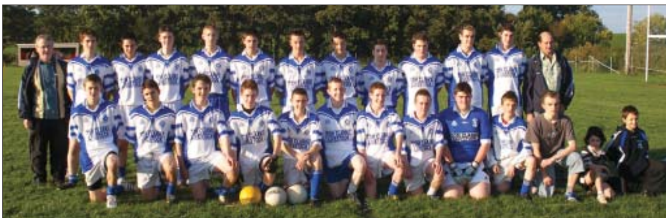
Minor Panel 2008