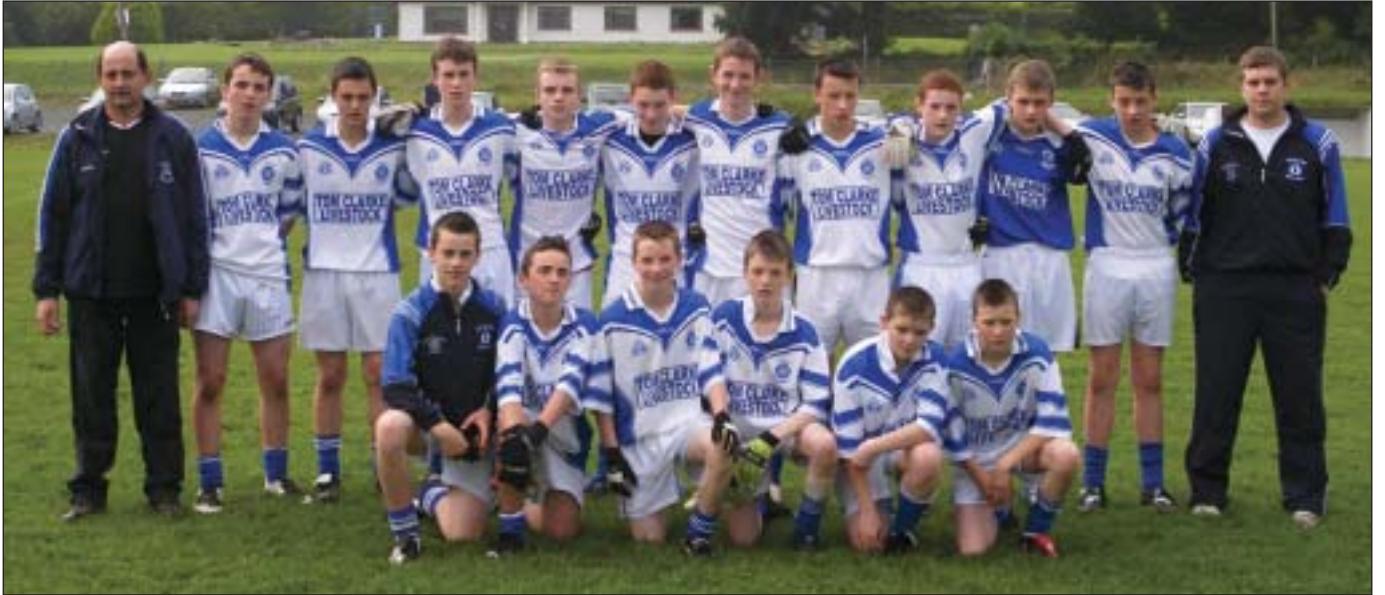
Under 16 Panel 2008