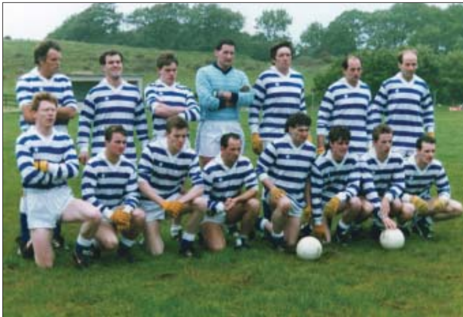
Intermediate Finalists 1992