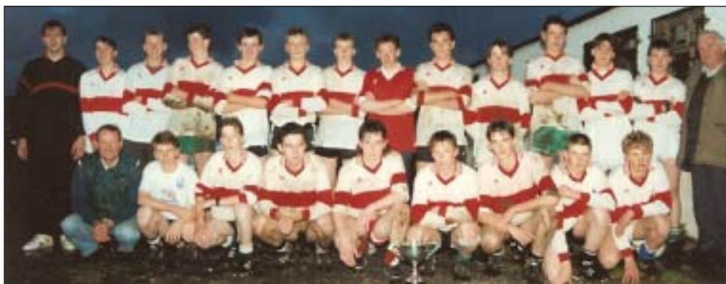
St. Nathy's Minor Champions 1992