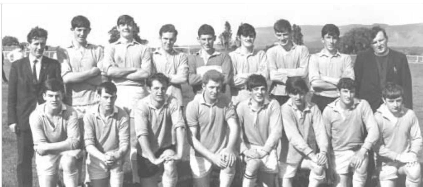
Sligo Minor Team 1968 - All Ireland Finalists.