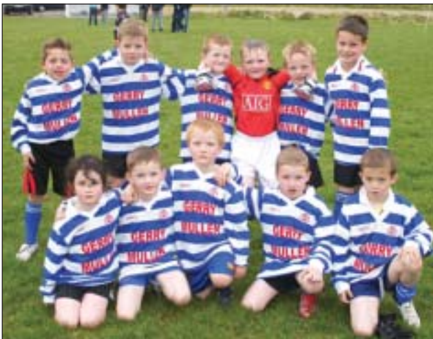
Under 8 Team 2008