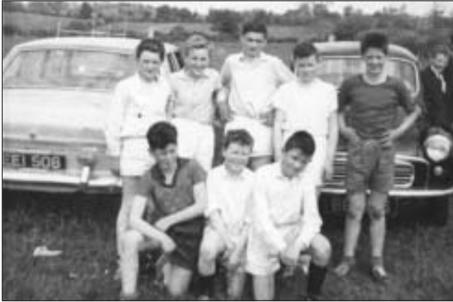
Achonry School Team in mid 1960's