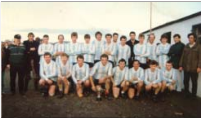
Benson Cup Winners 1991