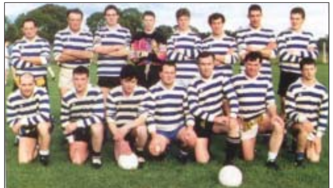
Intermediate County Final Team 1996