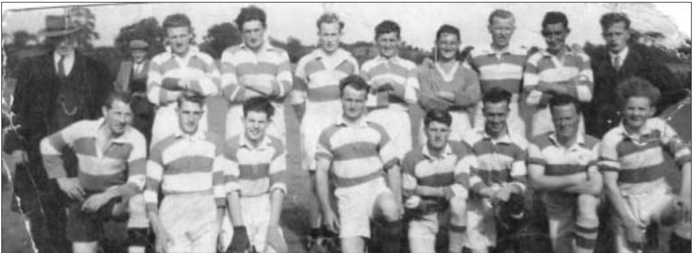
Mullinabreena/Bunninadden Team from circa 1950