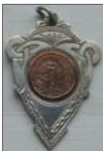
1958 County Medal

The players, representatives of the players no longer with us and club officials of the time will be presented with a specially commissioned commemorative piece of artwork. The artwork is inspired by the 1958 Senior Championship medal which was based on the Sligo Crest of the time.