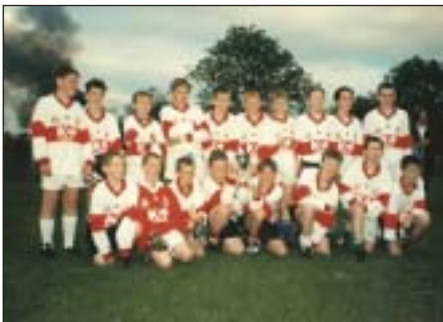
Club Team Photographs