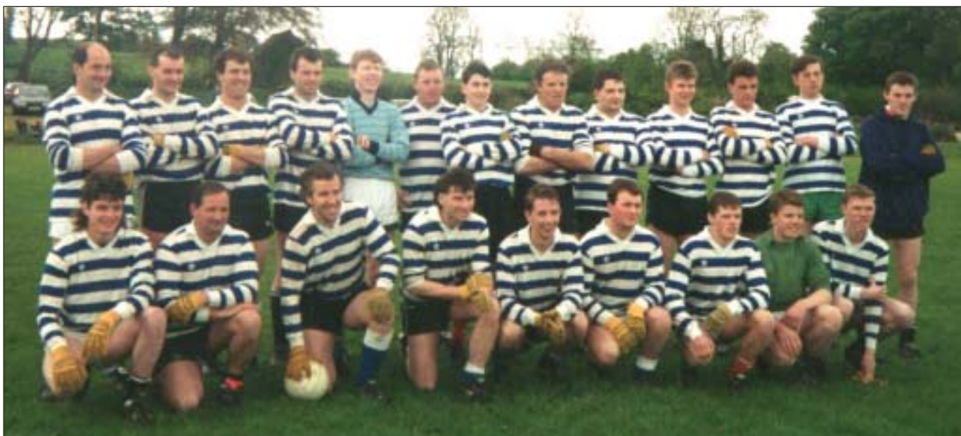
Nace O'Dowd Park Opening team 1994