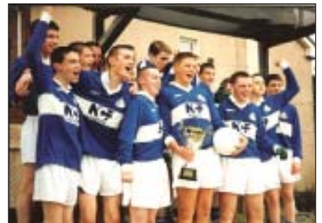
Minor B Champions 2002