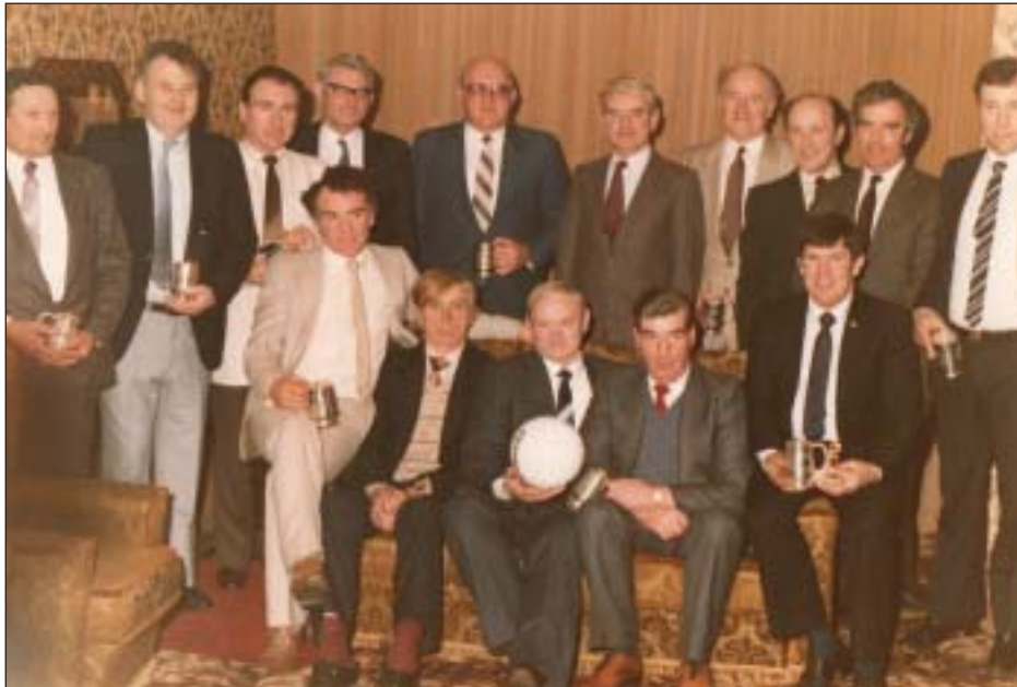
Silver Jubilee celebration in Cawley's, Tubbercurry

In 1998 Coolaney/Mullinabreena GAA Club set up their first website. It was one of the first clubs to have a website. In 2008 the site was completely redesigned and it now maintained by our current PRO Oliver Lee. The website address is www.coolaneymullinabreena.com The site has the following areas of interest: general news, underage news, events, lotto news, photo gallery, PRO updates and an extensive archive section. Please visit the site to keep fully abreast of the goings on in your club.