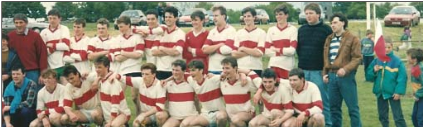
Under 21 Championship Winners 1993