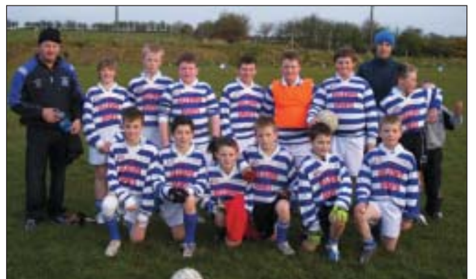
Under 12 Panel 2008 (A Championship Finalists '08)