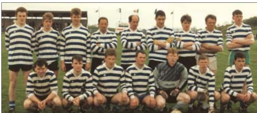
Mullinabreena Team for Bunninadden Pitch Opening in 1994