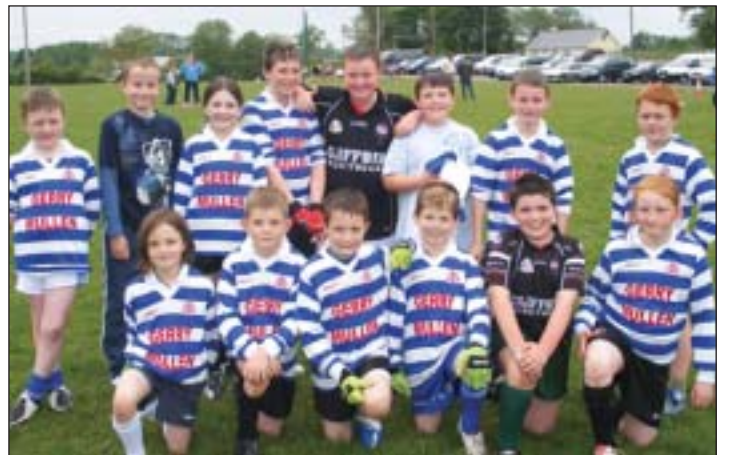
Under 10 Team 2008