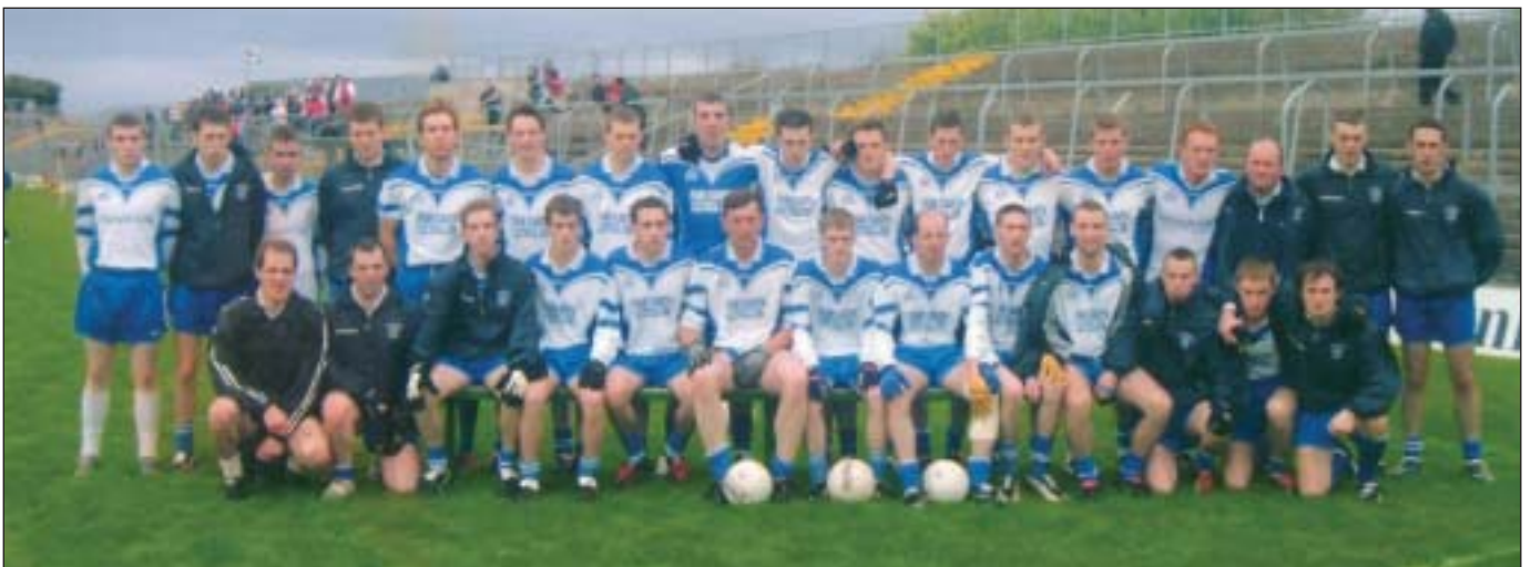
Intermediate Champions 2005