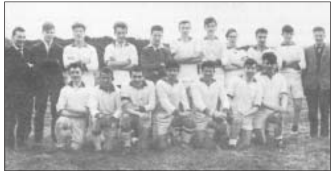
Mullinabreena, home based players, 30th Oct. 1966