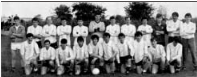
Mullinabreena Junior Champions 1988