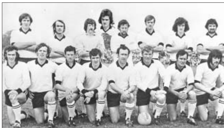
Sligo Connacht Champions 1975