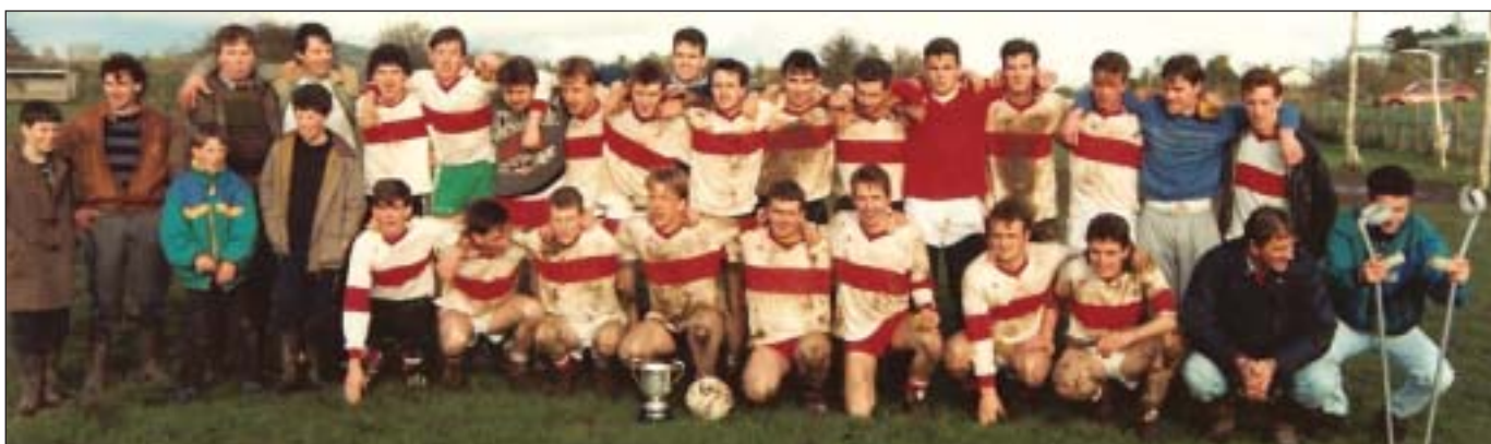
St. Nathy's Under 21 Championship Winning Team 1992