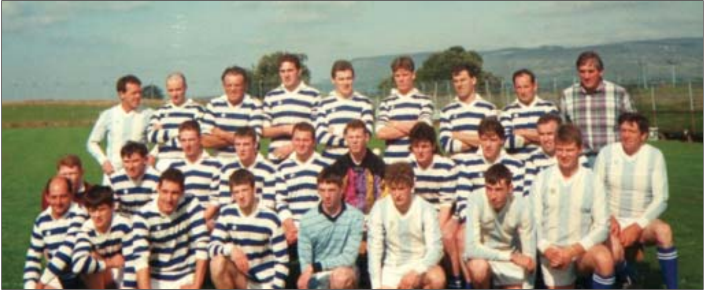
Intermediate Final Panel 1996