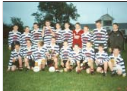
C/M U-14 C League Winners 1998