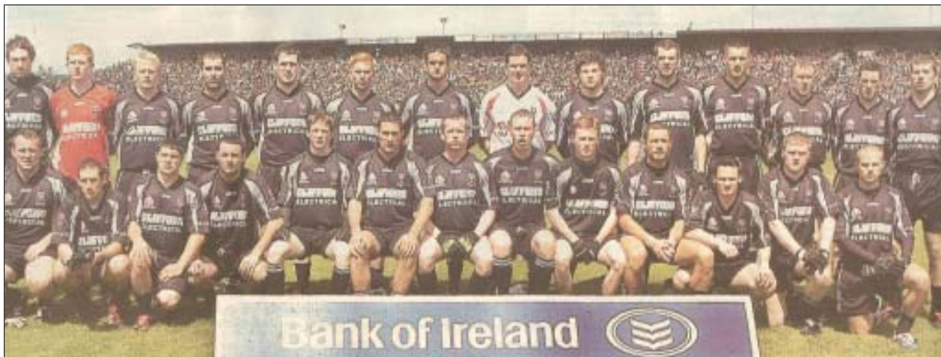
2007 Connacht Champions