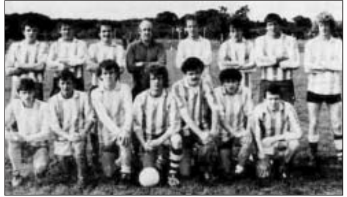
Junior Champions 1984